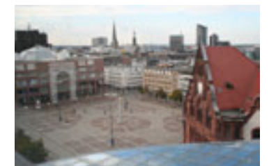
Rathaus am Friedensplatz Dortmund D