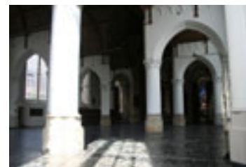
Grote Kerk Den Haag NL