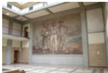
Licht- und Lohnhalle, Zeche Lohberg Dinslaken D