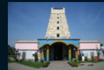
Sri Kamadchi Ampal Tempel Hamm-Uentrop D