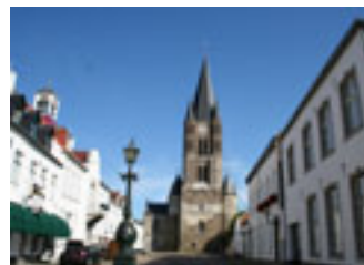
De Abdijkerk en Plain Thorn NL